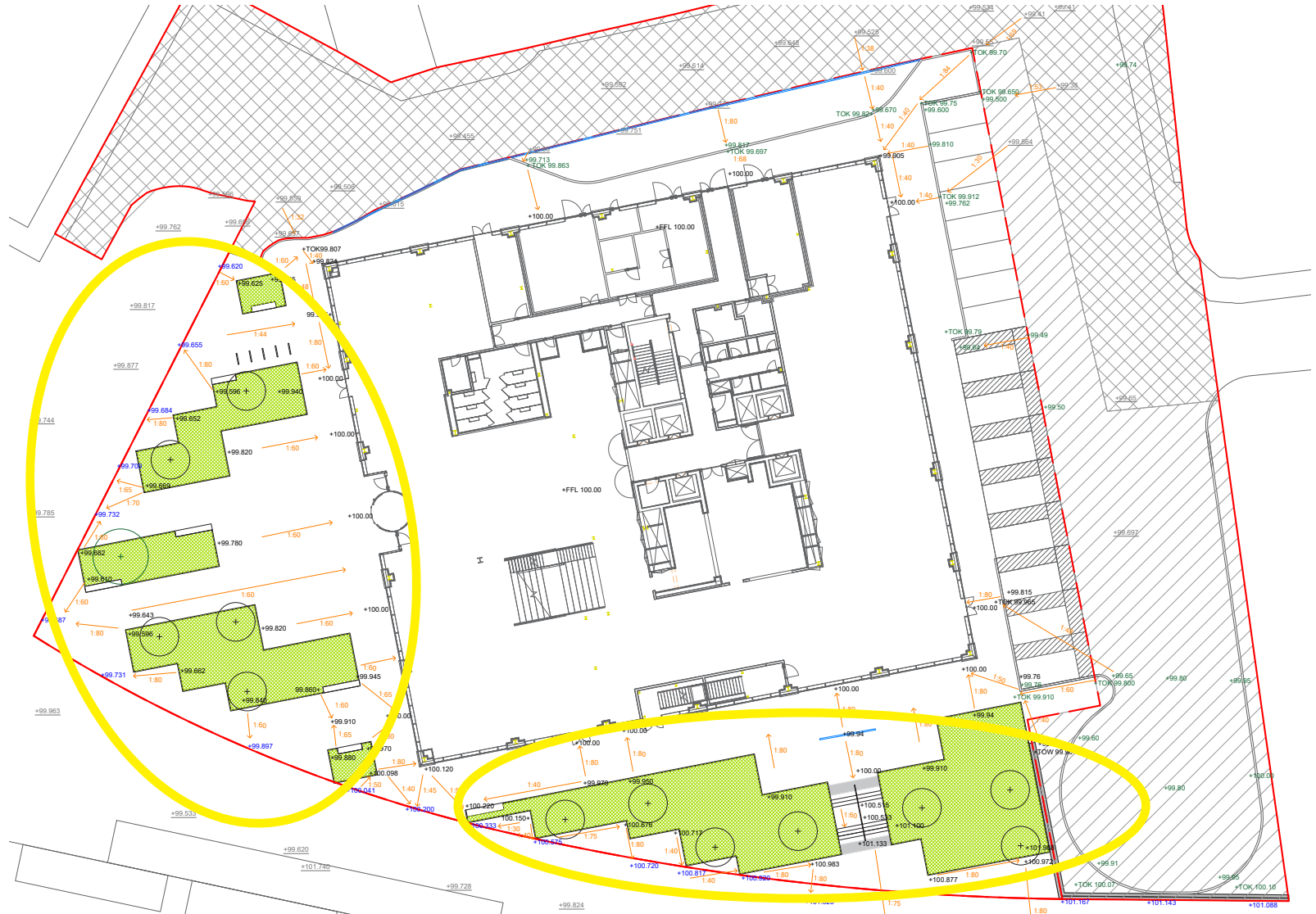
The artist's work could extend out to this adjacent area of landscaping if appropriate.

There are some fixed elements of the current design relating to drainage and security that will need to be incorporated by the artist.