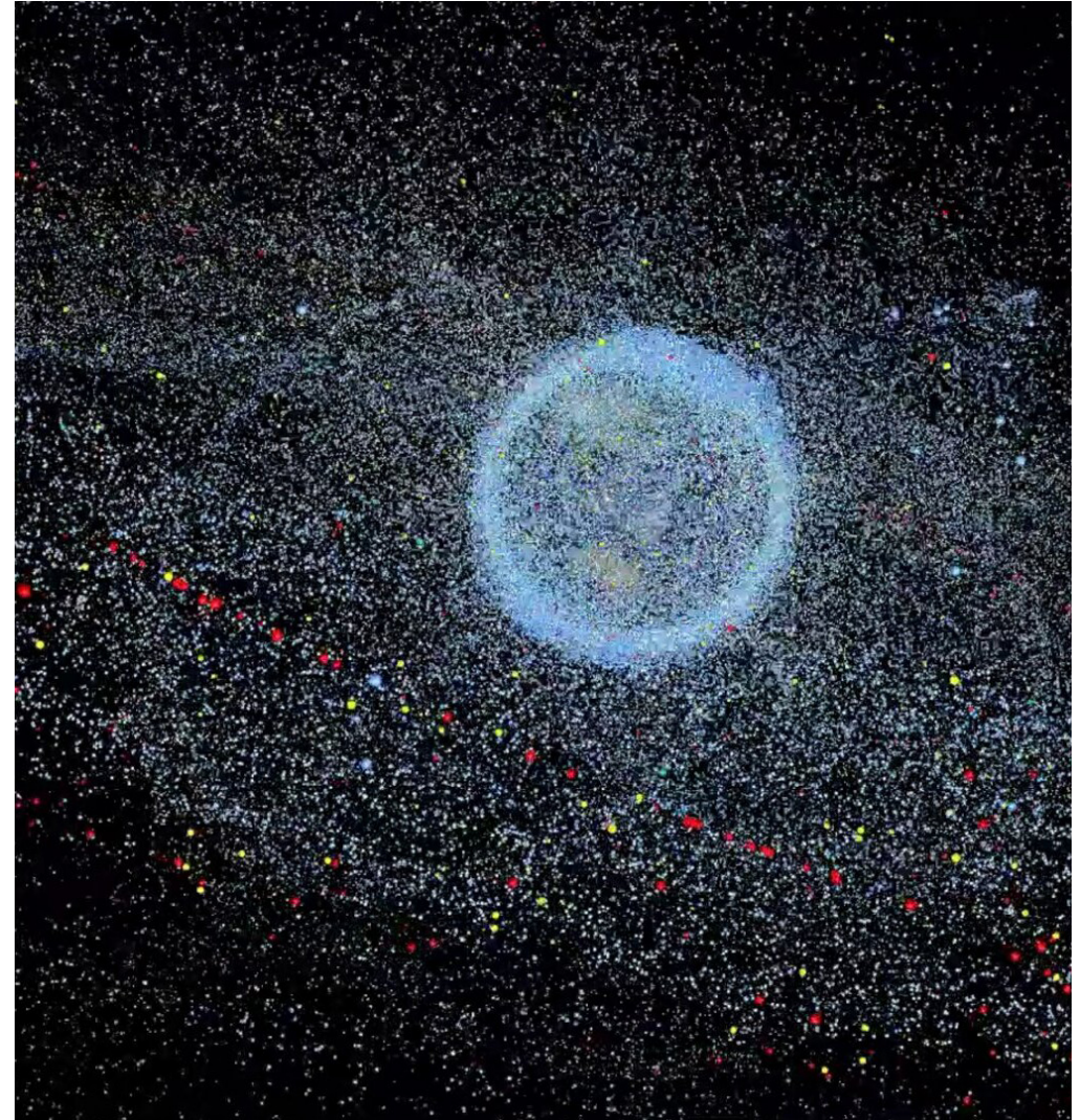
The UK Space Agency is currently investigating sustainable behaviour in space.

Where possible the creation of the artist's permanent work will be rooted in Swindon, aiming to work with local companies for the fabrication and installation of permanent work wherever possible.