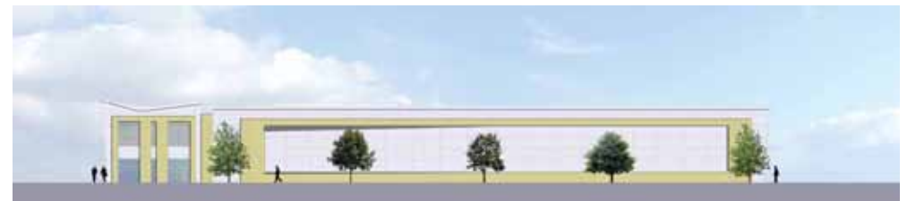
Indicative designs for (top to bottom): side street, boulevard, main street elevation and link road