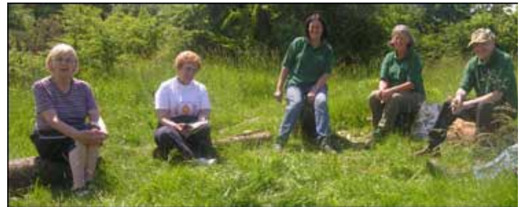
Patchway Conservation Group