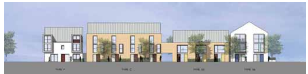
Above: An indicative housing design for the development Below: Indicative designs for a secondary street